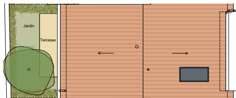
Plan des jardins